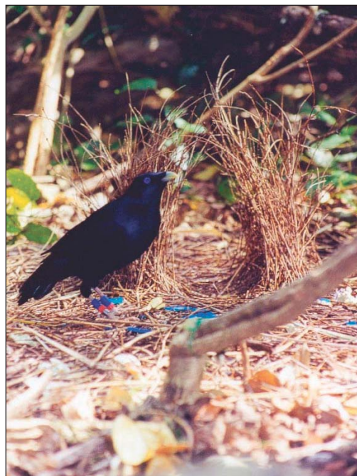
Showing off the bling bling. A male bowerbird decorates for potential mates.

Virginia Morell is a writer in Ashland, Oregon.